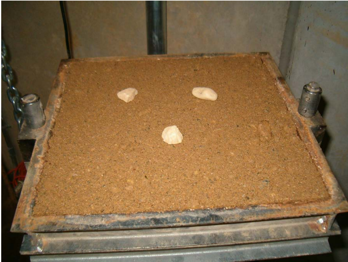
Figure 2. Rocks placed on prepared subgrade

tests resulted in punctures of the geomembrane where rocks were present. This is mainly caused by the thinning of the liner to conform to the shape of the rock and extreme pressure restricted to a point on the rock. In areas of the samples without rock placement, the geomembrane exhibited more acceptable deformation behavior. Figures 3 and 4 show the geomembrane samples after subjected to puncture testing. Holes greater than 1 mm were found on the points and edges of the rocks along with a significant thinning and deformation of the geomembrane around the rock locations. These results show that rocks on the subgrade significantly increase the risk of geomembrane perforation during the service life of a containment facility. Therefore, increased control of rocks on the subgrade is necessary, especially when the geomembrane will be subjected to high overburden pressures.