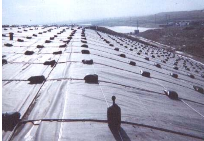
Figure 1. Completed Exposed Geomembrane Cover System from Top Crest of Slope.

consideration for this application. Several other design references are available in the literature describing the approach (Gleason et al., 1998, Gleason et al., 1999, Germain et al., 2001). Using this design method, the only viable hold-down mechanism to keep the cover from being blown away due to a significant wind velocity is to use fully backfilled anchor trenches or soil berms on benches. The primary author believes this is conservative as evidenced by successful designs that have not used such extensive ballasting. Nonetheless, to reduce the probability of failure, the more conservative design approach was used for a maximum assumed wind velocity of 40 m/s. A general picture of the completed cover system is shown in Figure 1.