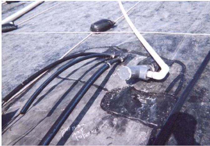
Figure 4. Photo of Pipe Penetration Group.

The issue of the birds was foreseen, but not to the degree it was actually experienced. The two main areas that the birds peck at are the flaps on geomembrane seams, and the sand bags. If the flap left over from welding the geomembrane was left in place, the birds felt an irresistible need to peck inside the flap, thereby endangering the geomembrane. This was solved by cutting away the flap, and the birds stopped pecking on the seams. Solving the issue for the sandbags has been more problematic. The problem became so severe, that tires with covers were placed over the sandbags to protect them. The bottom side of the tires had to be cut out to fit over the sandbags, and a stiff piece of polyethylene geomembrane inserted over the top of the tire to keep the birds out. A photo of the tire protection installation is shown in Figure 5.