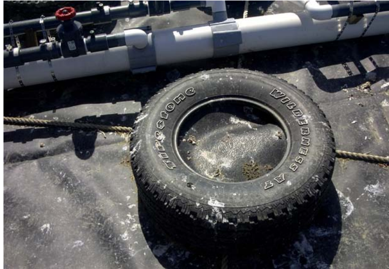
Figure 5. Photo of Tire Protection Over Sandbag.