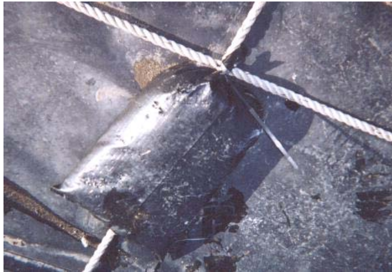
Figure 3. Photo of Sandbag Attached to Rope Node (note bird pecking holes).

each way. Experience has shown this material lasts approximately 5 years in an exposed environment. A typical sandbag attachment at a rope intersection is shown in Figure 3.