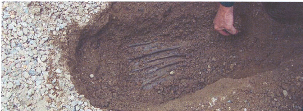
Figure 3. Bunched-up wrinkles in PVC at toe of 4:1 slope.