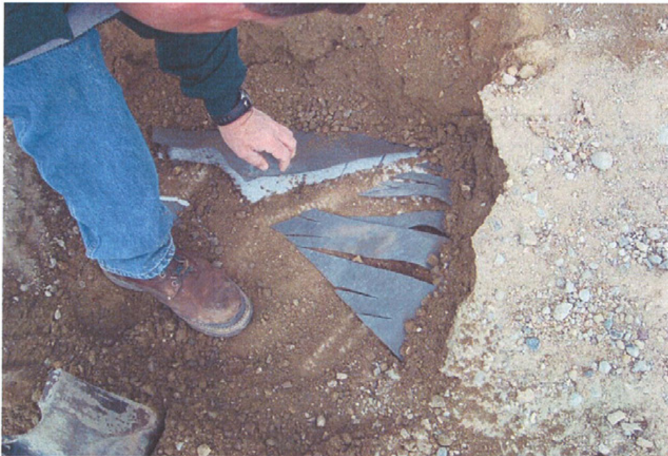
Figure 5. Standing on exposed GCL (obscured with sandy gravel cover) and lifting edge of torn PVC. Clean white GCL can be seen been raised edge of torn PVC. Condensation water was noted on bottom side of PVC.