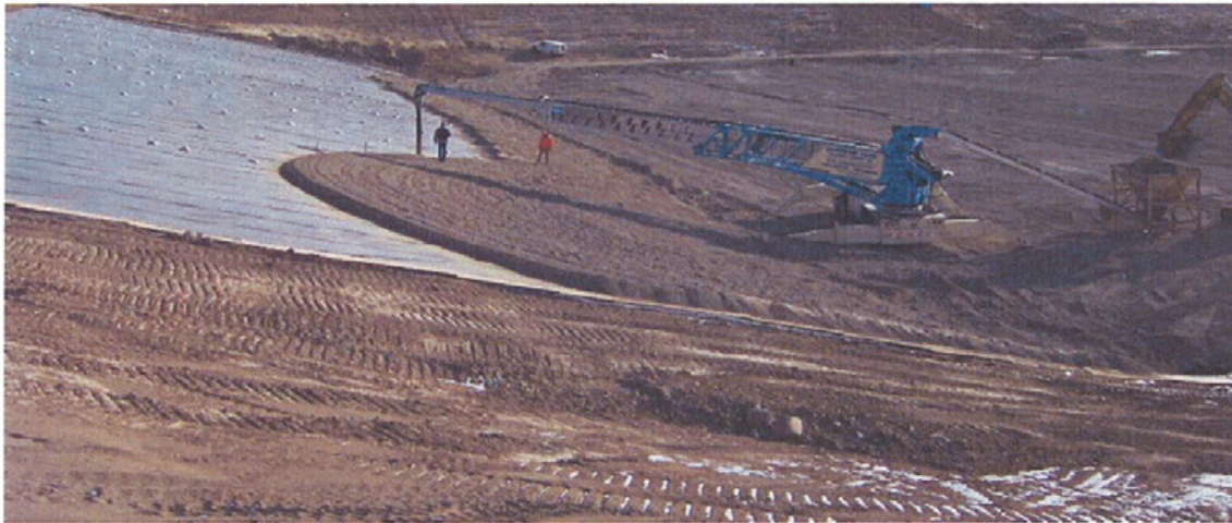
Figure 1. Placing gravel onto PVC with telebelt on 4:1 slope.

The failing interface was clearly between the PVC and the GCL. The exposed GCL appeared unstressed and undamaged.