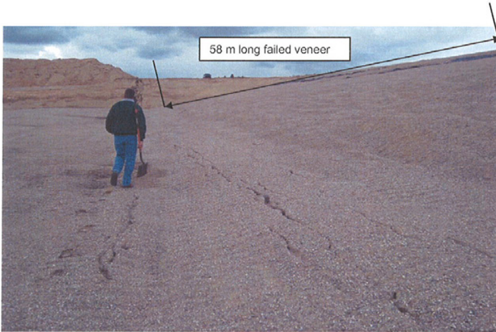
Figure 4. Deformed and cracked cover soils near toe of slope.